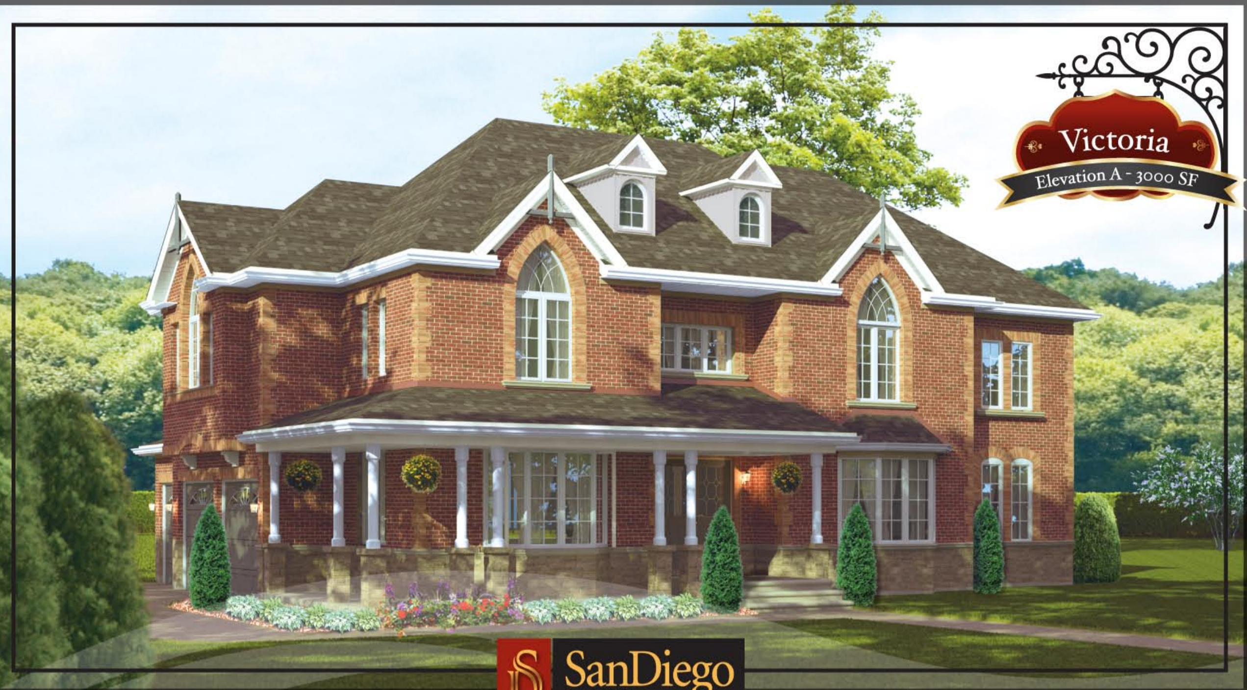
Victoria Elevation A - 3000 SF