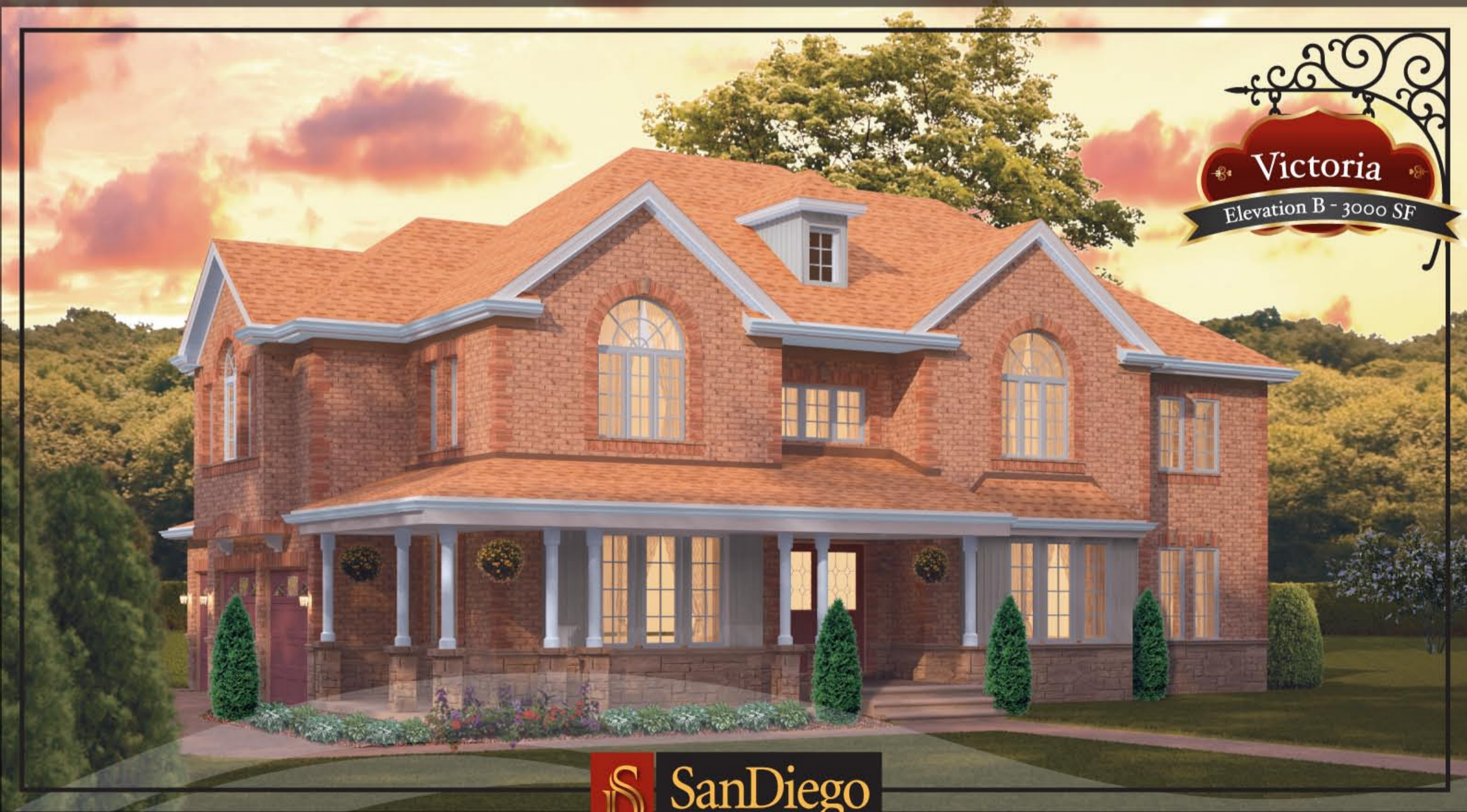
Victoria Elevation B - 3000 SF